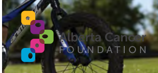
Placing a colour logo on a photo